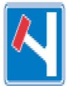
No through road for traffic in the direction indicated from junction ahead