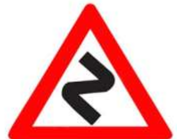
Series of bends