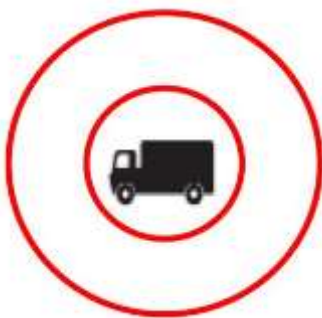
Designated for bus or truck only for loading and unloading