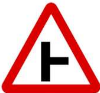
Side (feeder) road right