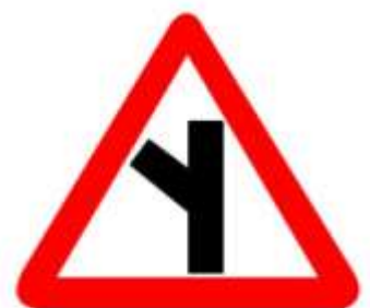
Y – Intersection