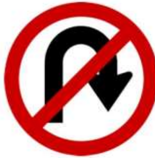
No 'U' Turn