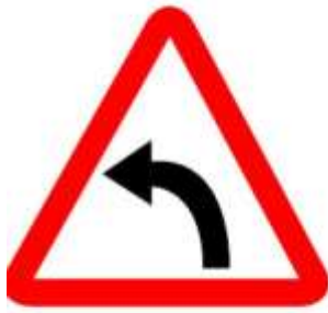
Left hand curve