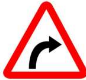
Right hand curve