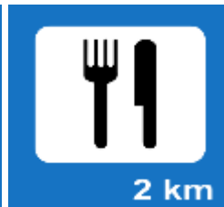
Shops and Restaurant ahead