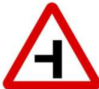
Side (feeder) road left