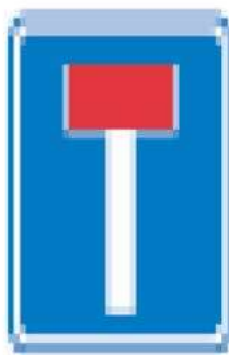
No through road for traffic