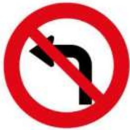
No left turn