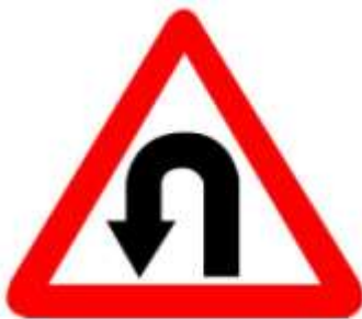
Left hair pin bend