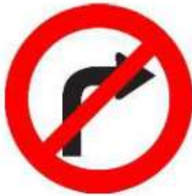
No right turn