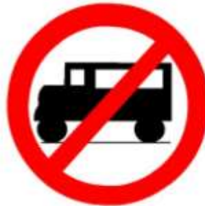
No Trucks allowed