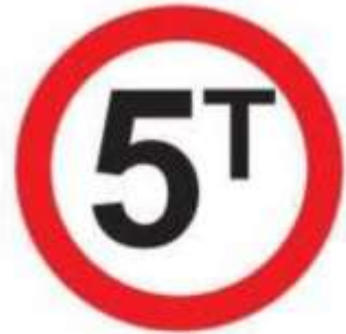
Load (weight) restriction