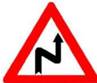
Right Reverse Bend