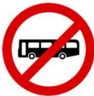
No buses allowed