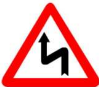
Left Reverse Bend