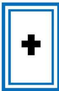
First Aid post