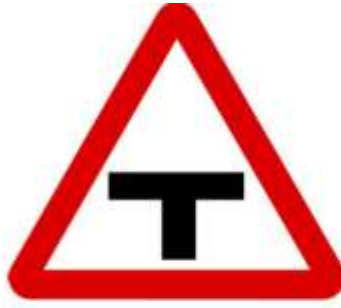
T – Junction